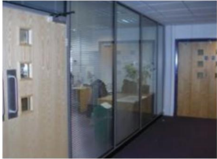
Glazed partitions with integral blinds installed at Power Station in Kent