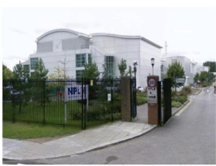
Steel stud partitioning installed to a security wing in Teddington