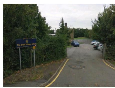
Partitioning installed to a Primary School in Dartford