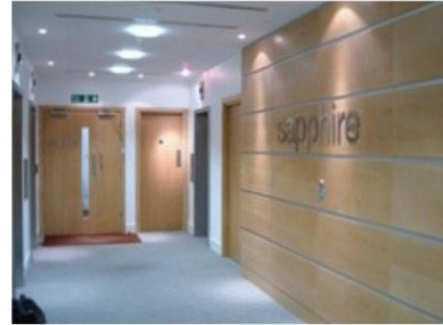
Panelled partitioning installed in offices at Lower Thames Street