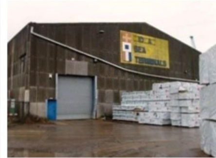
Fire rated partitioning installed to this building at Ridham Dock